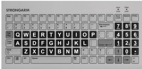
Mechanical Keyswitch Membrane Keyboard