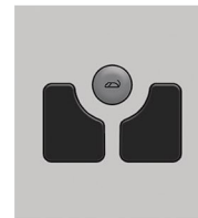
DuraPoint (PS/2 only)