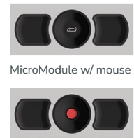
MicroModule w/ mouse