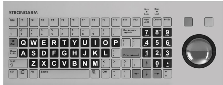
Mechanical Keyswitch Membrane Keyboard with Integrated Trackball