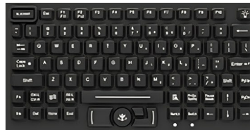
Rubber Keyboard with MicroModule