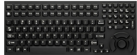
Rubber Keyboard with Hula Pointer