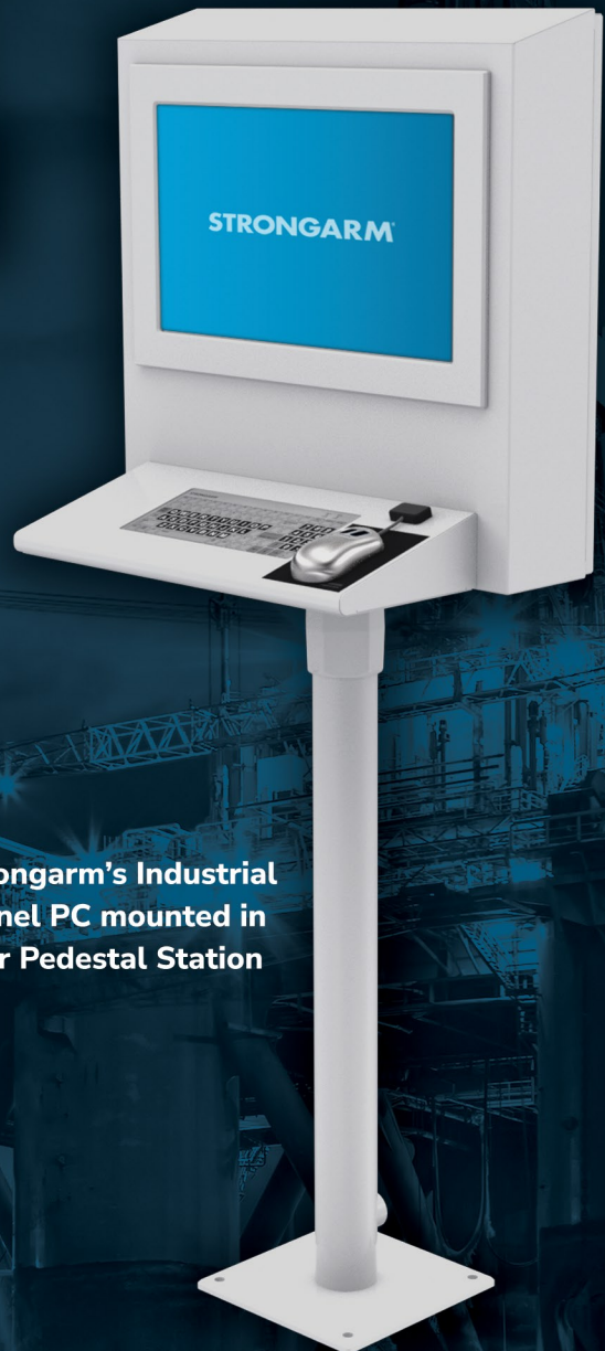
Strongarm's Industrial Panel PC mounted in our Pedestal Station

Our Industrial Panel PC offers the reliability, configurability, and rugged construction that modern industrial automation demands.