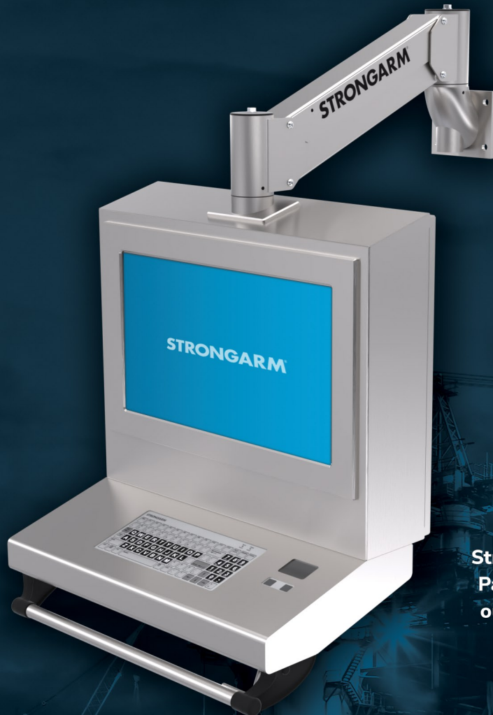
Strongarm's Industrial Panel PC mounted in our MiniStation™ with our Vertica™ counterbalanced and adjustable mounting arm

Strongarm's versatile panel-mount design allows easy integration with enclosures and a variety of operator interfaces.